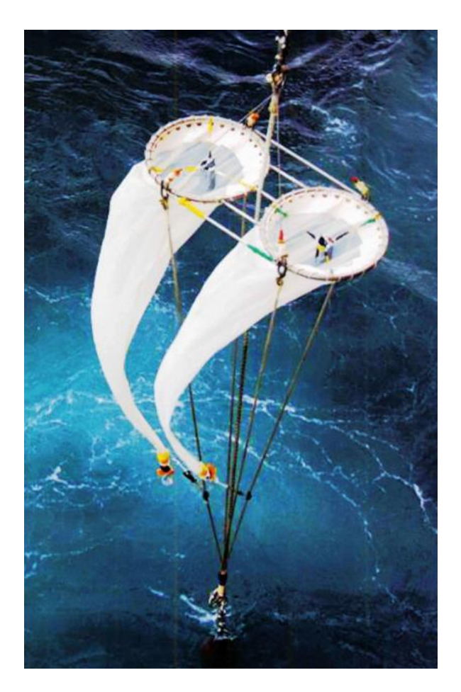
Fig. 3. The twin NORPAC standard net. Flow-meter is attached at each mouth ring of net.