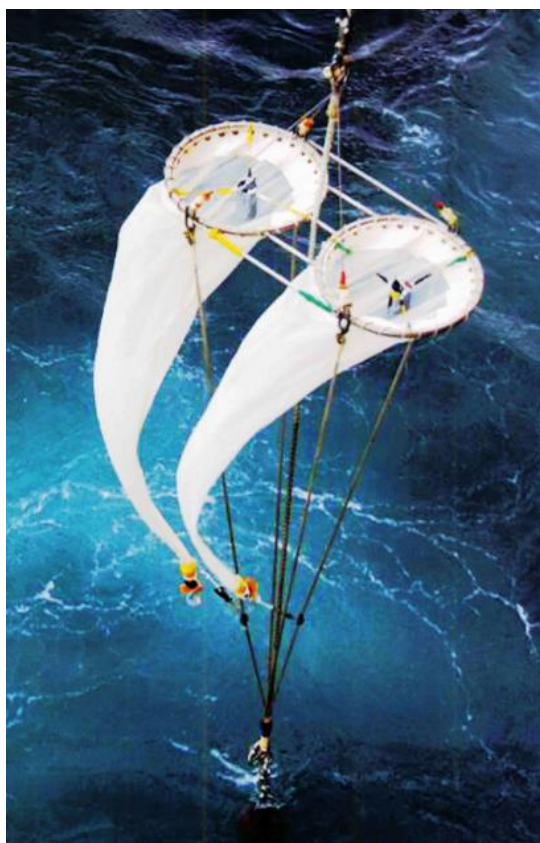
Fig. 2. The twin NORPAC standard net. Flow-meter is attached at each mouth ring of net.